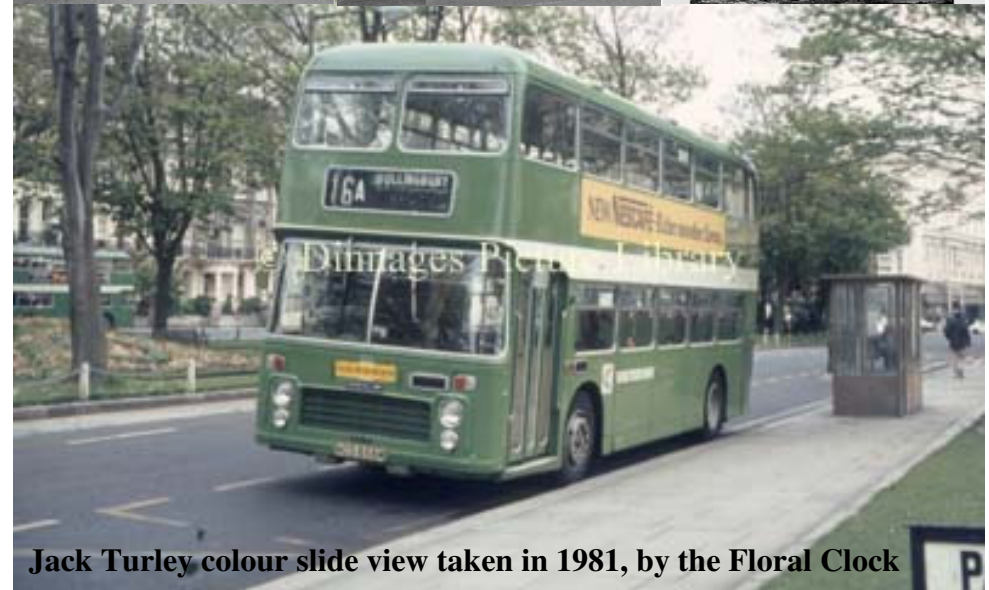
Jack Turley colour slide view taken in 1981, by the Floral Clock